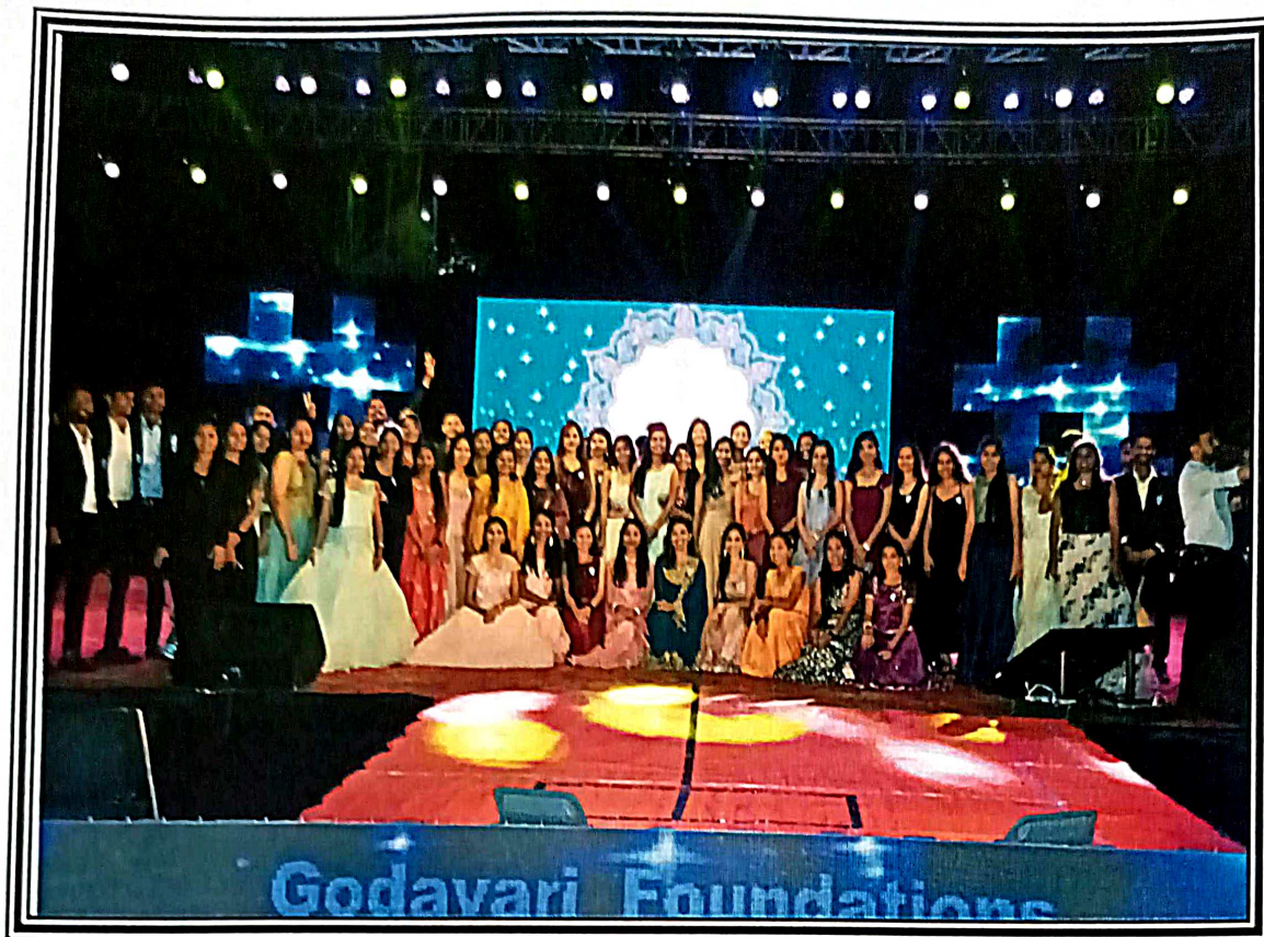
Fig.10- The Organizers (SANGHARSH) Final Year Basic B Sc Nursing