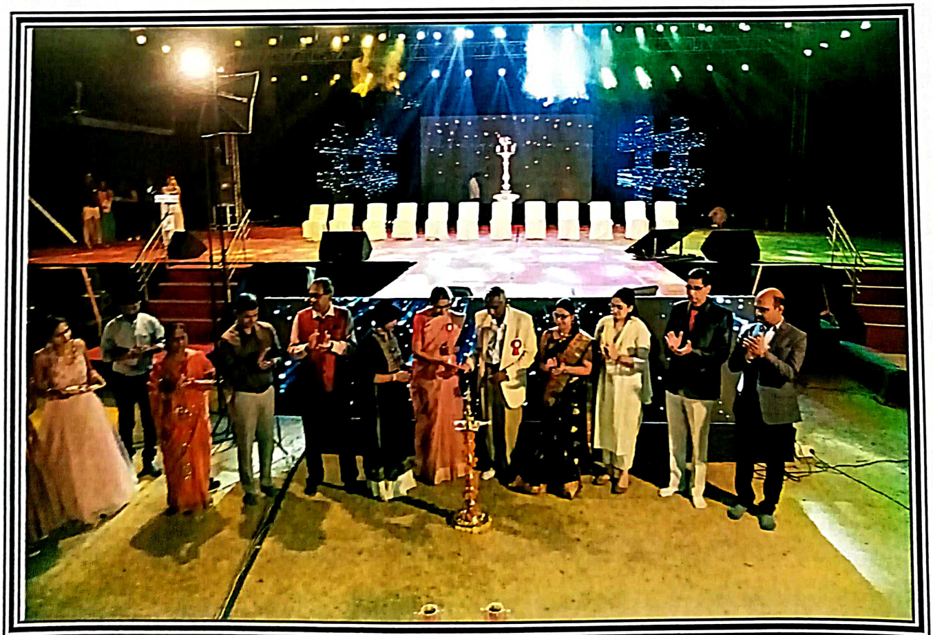
Fig.02-Deep Prajwalan by the Guests