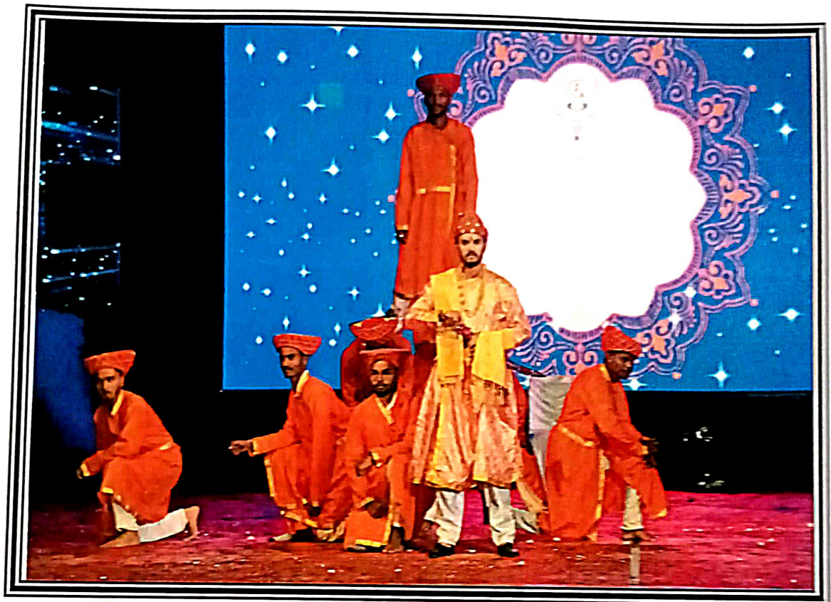
Fig.06- Some photos of cultural Program as below