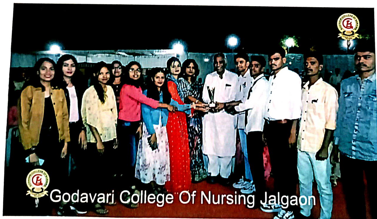
Fig.9- Best Class of the Year 2023 award (1 B BSc Nursing)