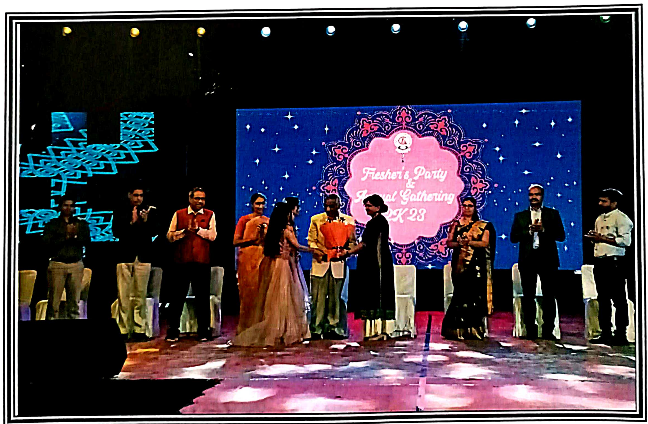
Fig.03. Felicitation of Guests