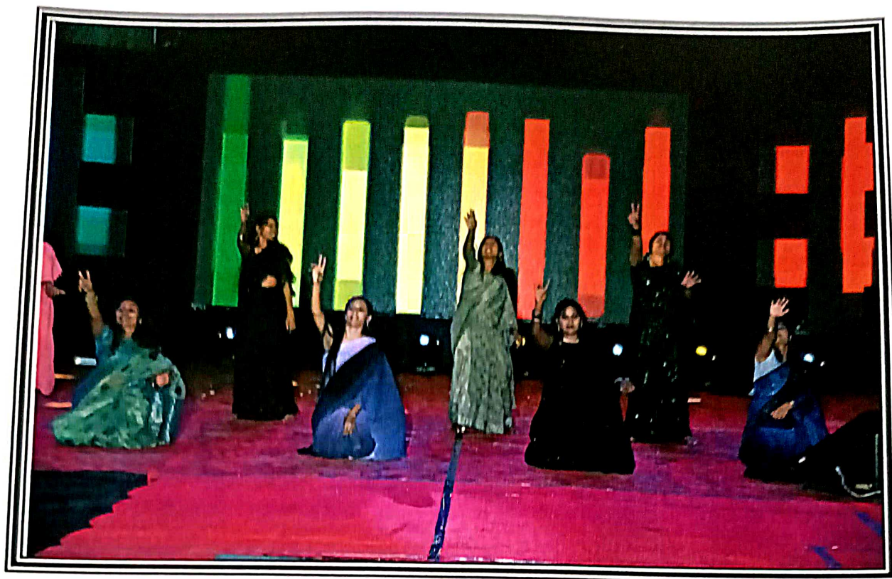
Fig.08- Dance Perform By Teachers of GCON