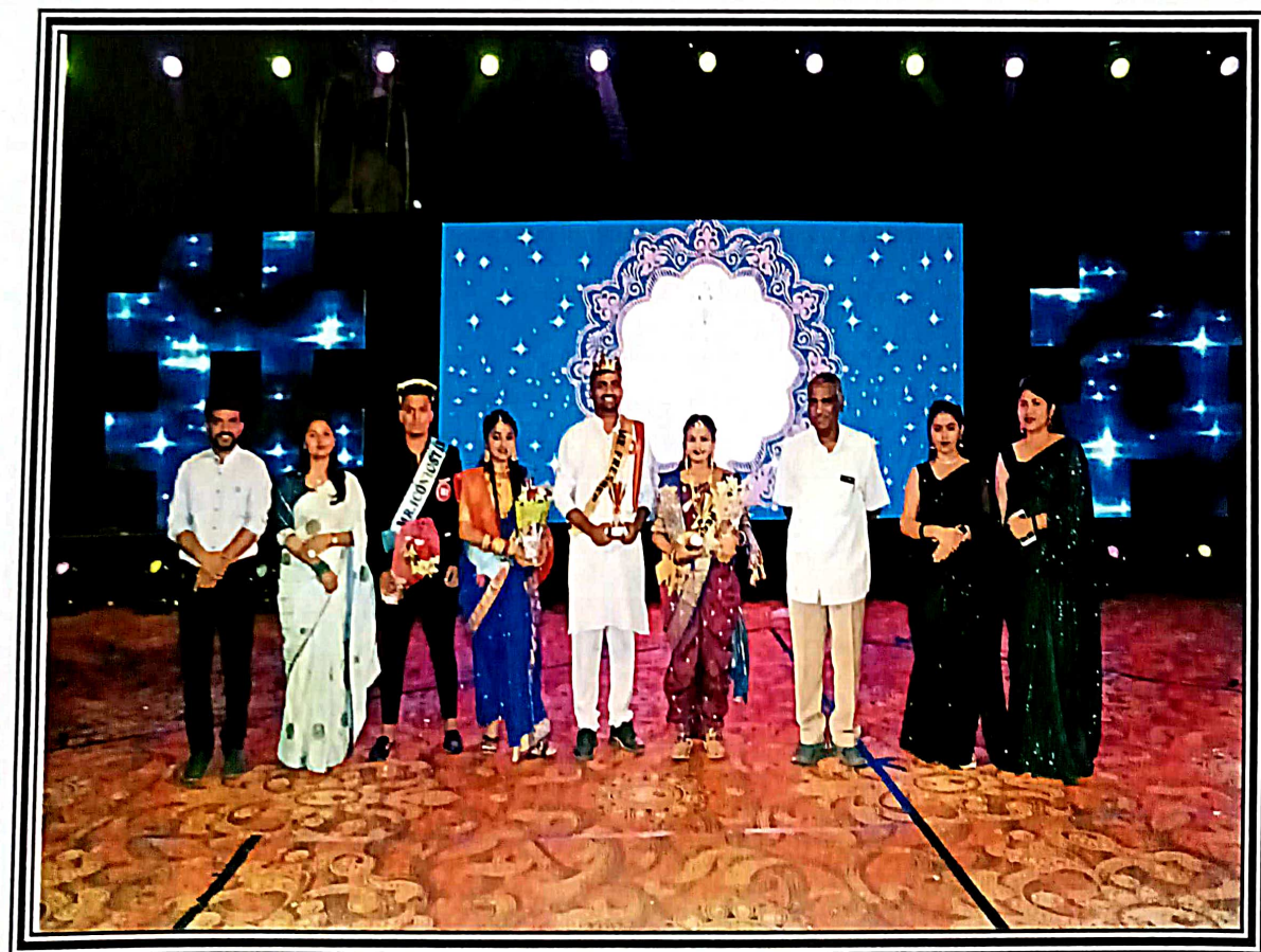
Fig.11 Mr. Fresher and Ms. Fresher 2023