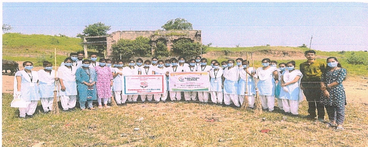
FIG.1. The Department of community health nursing and students.

PHOTOS: SWACHH BHARAT MISSION 01/10/2023