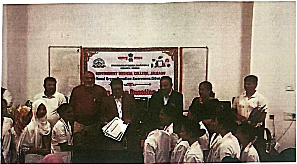
Fig 03- Prize and certificate Distribution