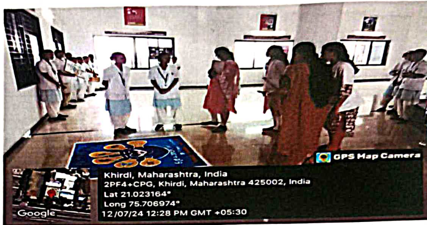
Fig 05- Rangoli competition