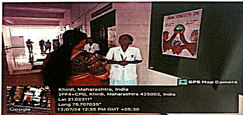
Fig 04-Poster competition