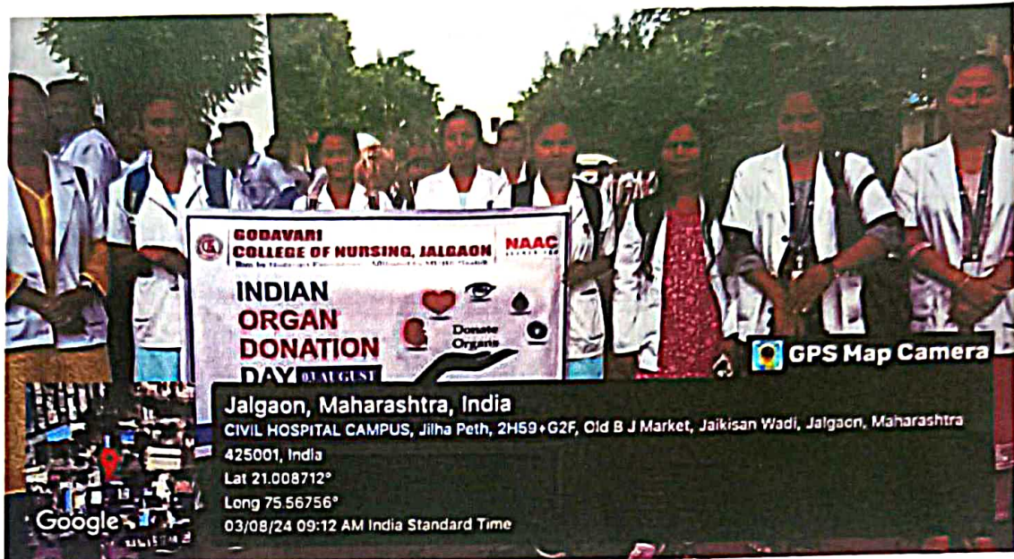
Fig.01- Organ donation awareness Rally