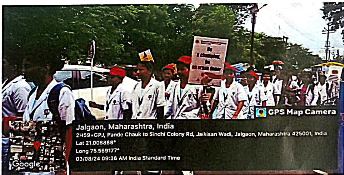
Fig.02- Slogan through encourages to people