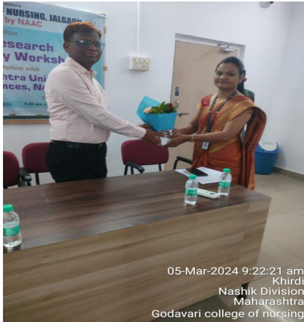
05-Mar-2024 9:22:21 am Khirdi Nashik Division Maharashtra Godavari college of nursing