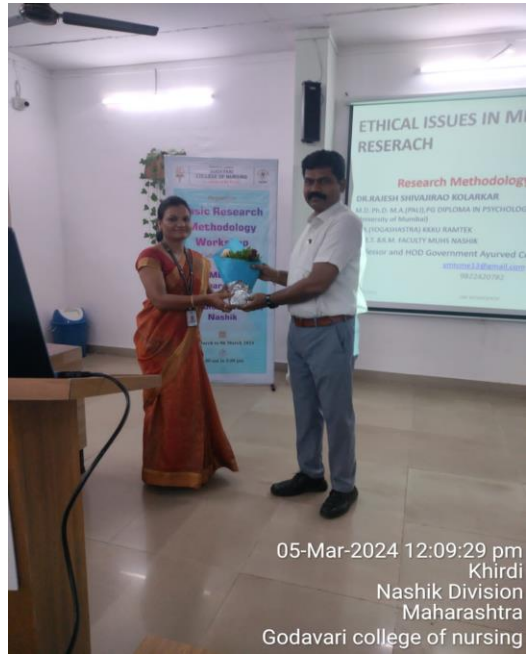
05-Mar-2024 12:09:29 pm Khirdi Nashik Division Maharashtra Godavari college of nursing