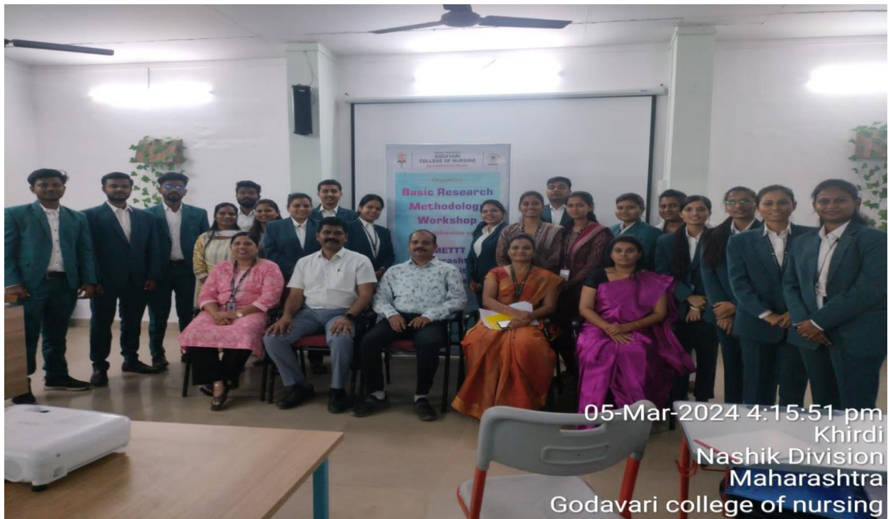
05-Mar-2024 4:15:51 pm Khirdi Nashik Division Maharashtra Godavari college of nursing