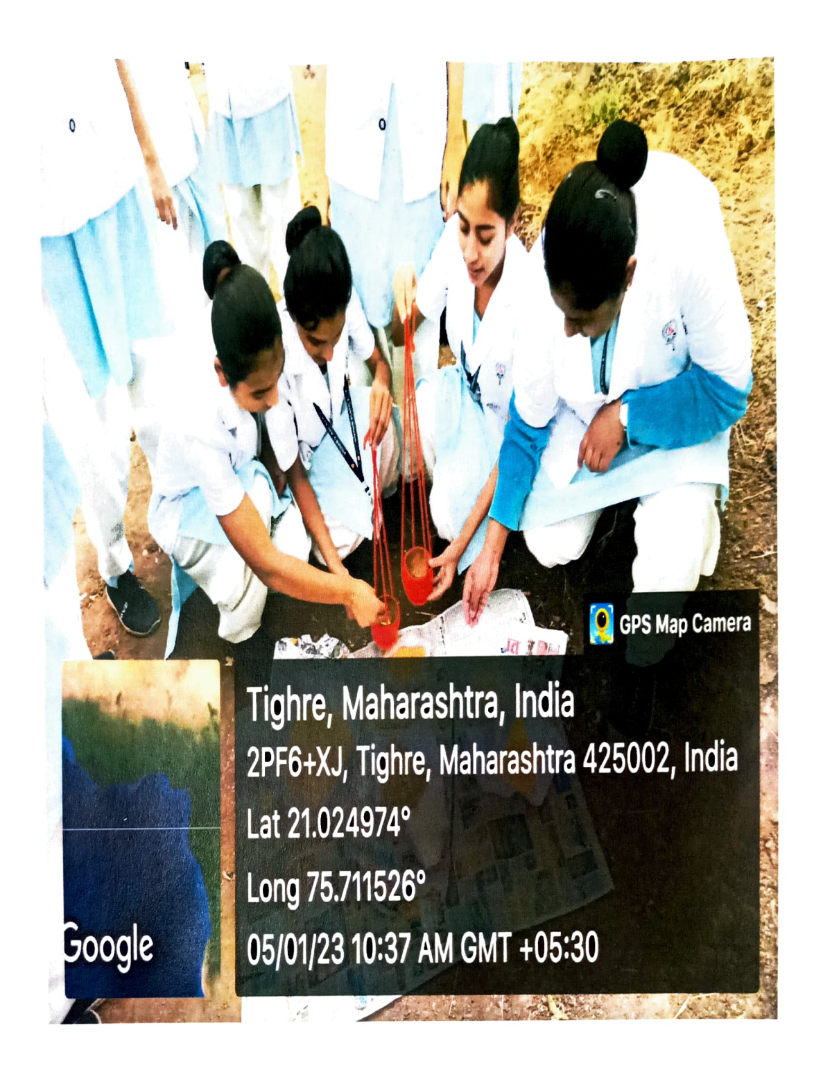
Fig 1. B.sc First Year Student's Active Participation In Bird Feeder Activity