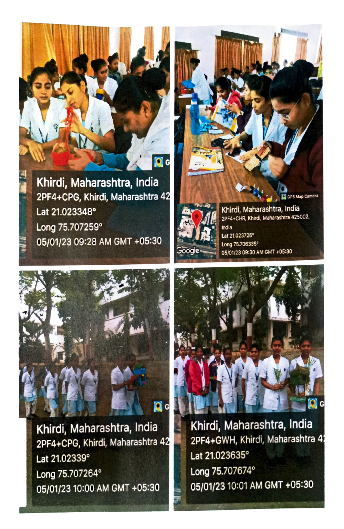
Fig 2 . All Student's Active Participates In Bird Feeder Activity