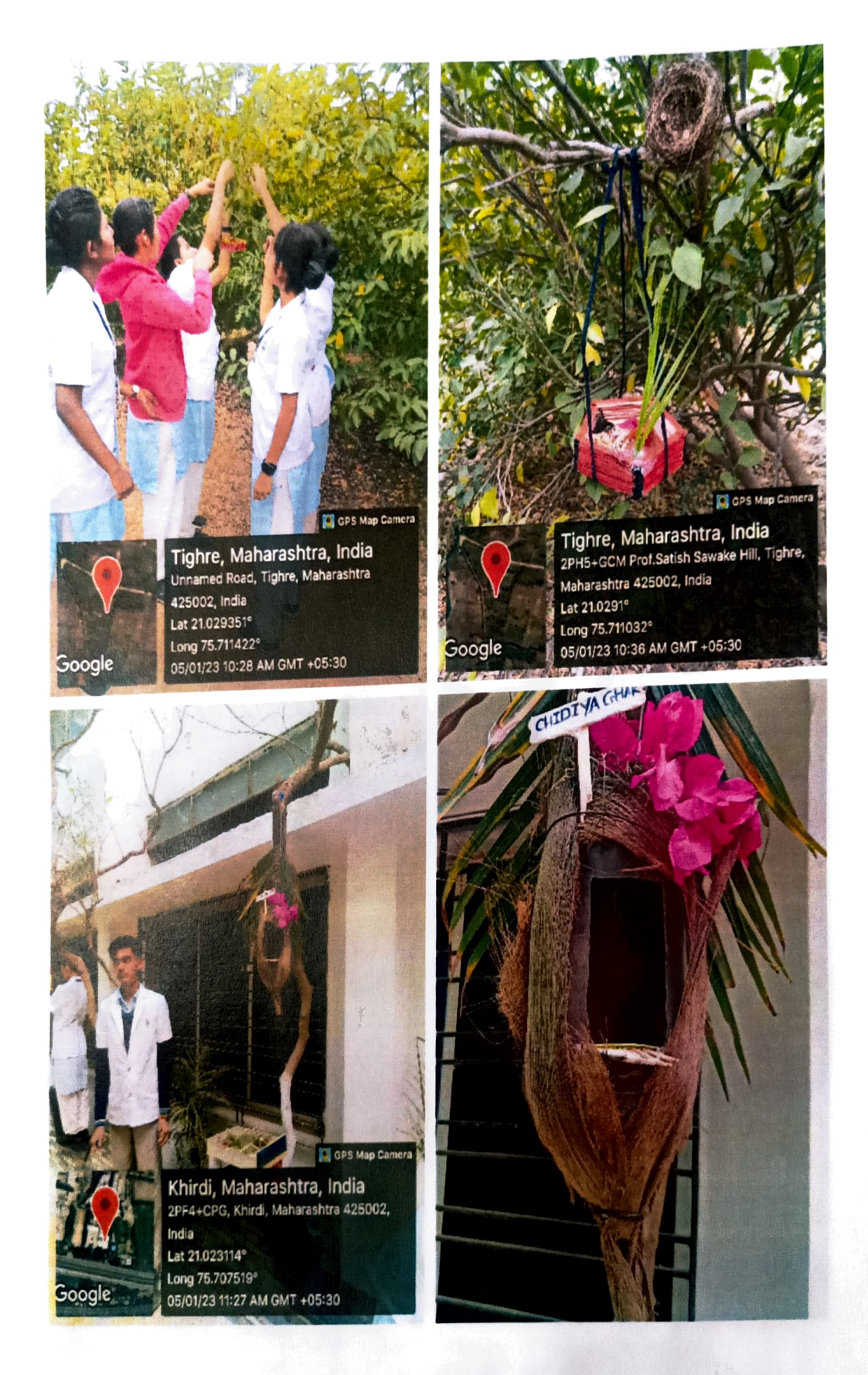
Fig 4. Activities Done By Students