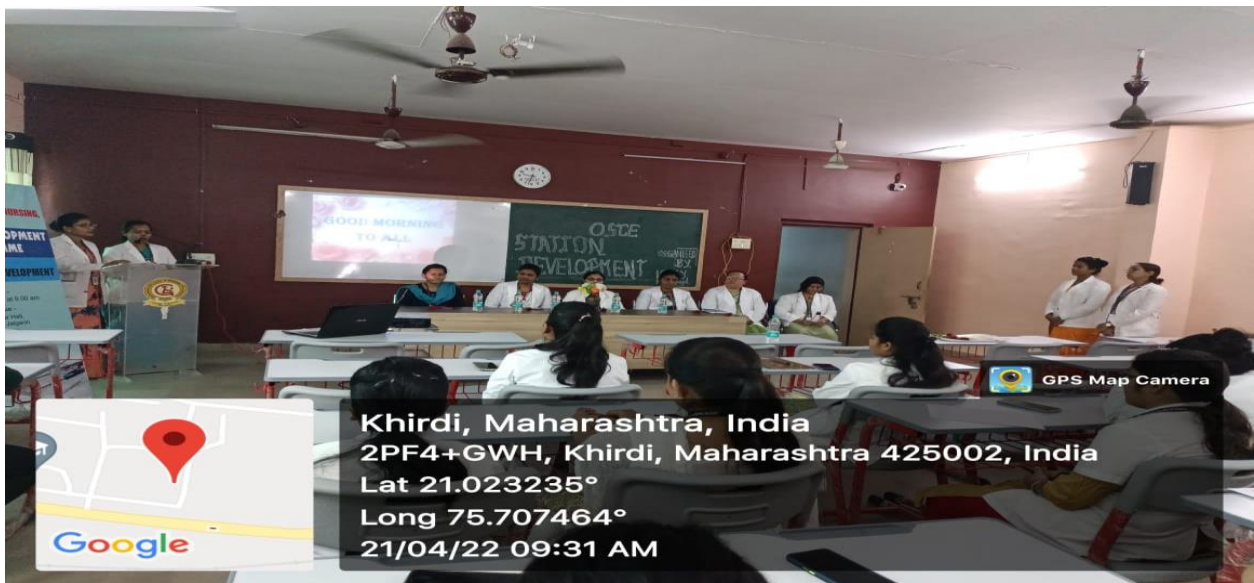
Fig.02.WELCOME FOR THE ENTIRE DIGNITARY