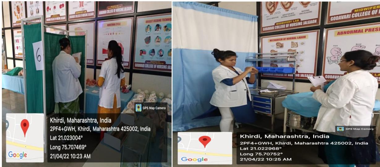
Fig.05: ACTIVITIES FOR STAFF