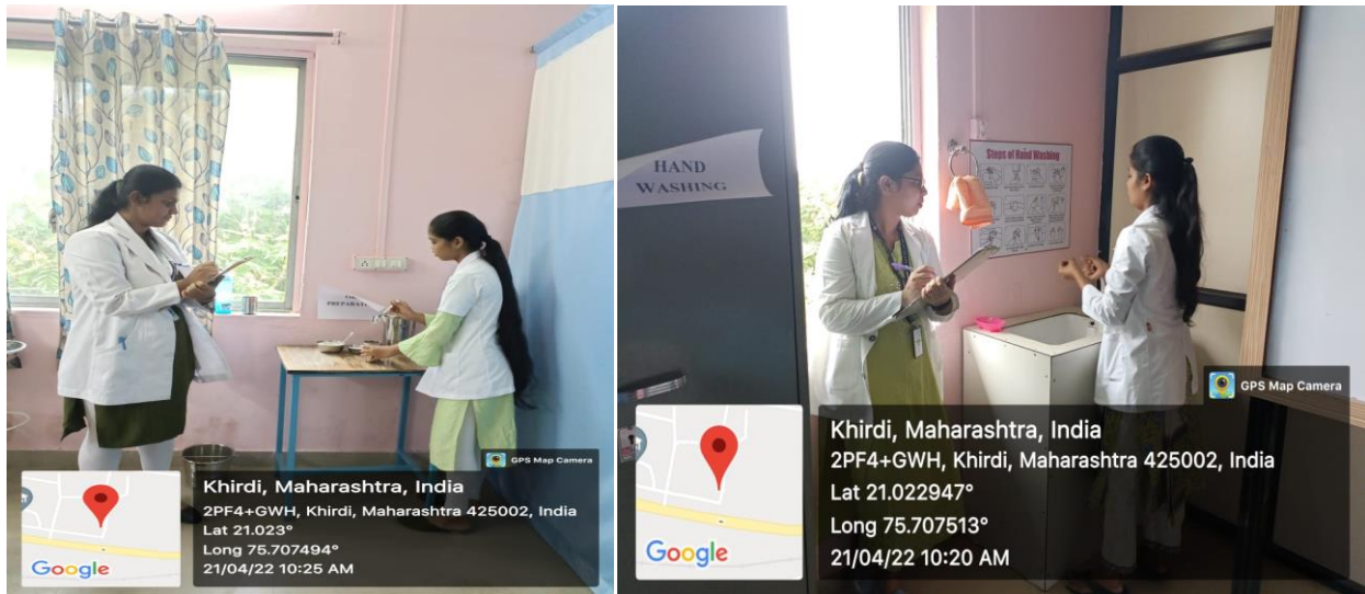
Fig.06: ACTIVITIES FOR STAFF