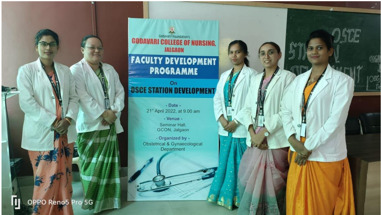
Fig. 01.ORGANIZING COMMITTEE