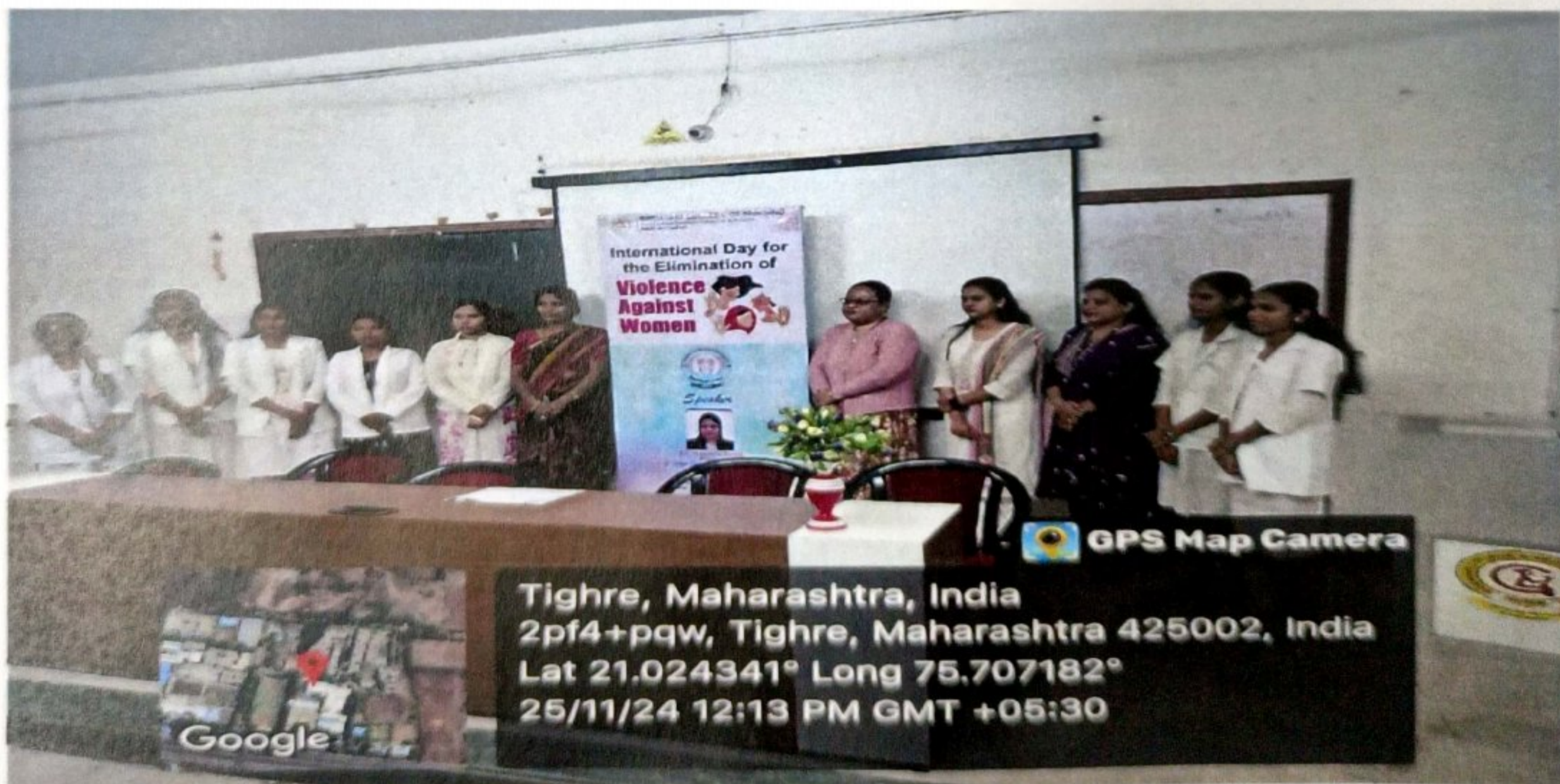
Photo session with Guest speaker and all the Obstetrics and Gynaecology dept. Faculty.