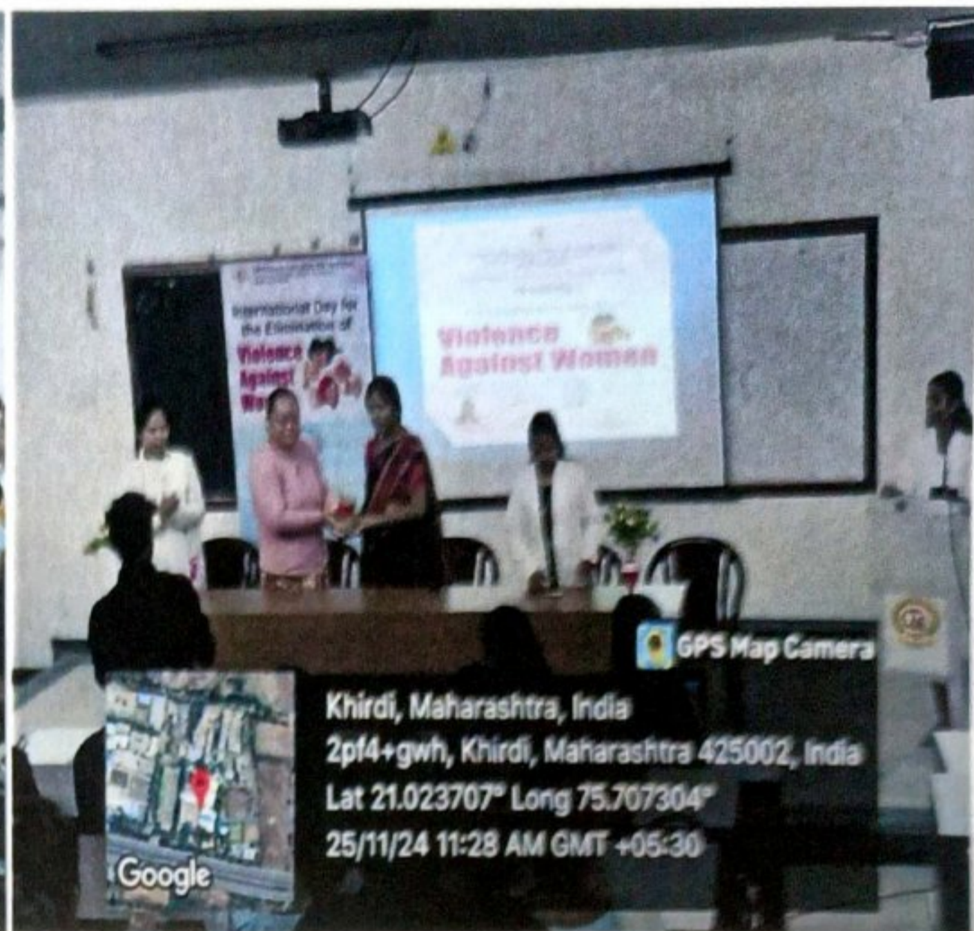
Group of students attended the programme and felicitation of guest speaker.