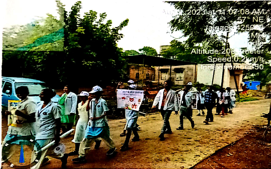
Fig. 01- Awareness rally world organ donation day