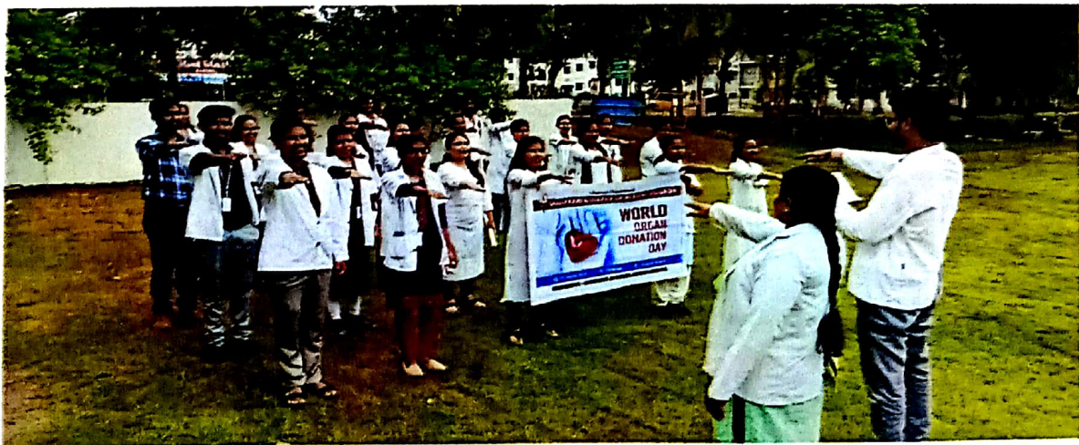
Fig. 02- Faculty & Students taking Pledge