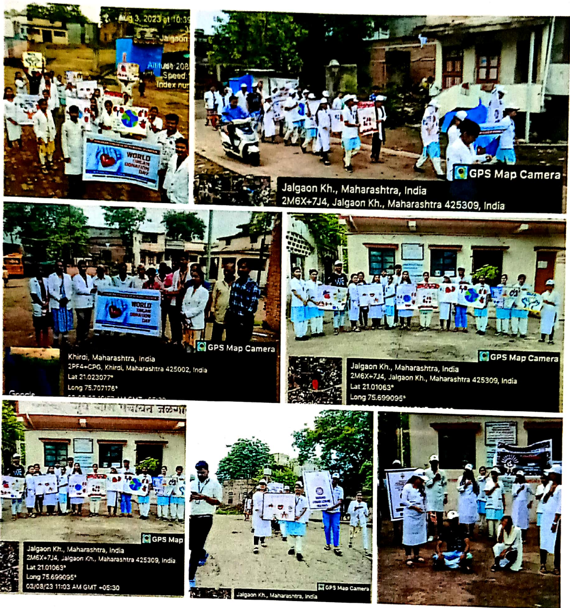
Fig.03 - Posters and rally by students